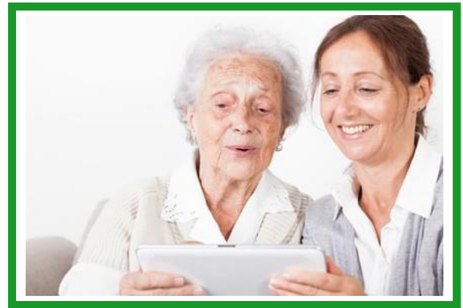
Staff member sharing the Carevium App with a senior